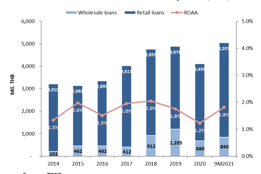
Chart 2: TSFC's Loan Mix and Returns on Average Assets (ROAA)